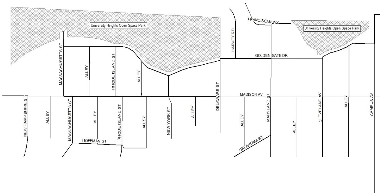
Map 63.0120-A University Heights Open Space Park

(Added 7-19-2016 by O-20678 N.S.; effective 8-18-2016.)