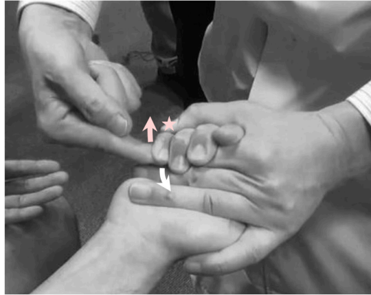
ulnar N. C8